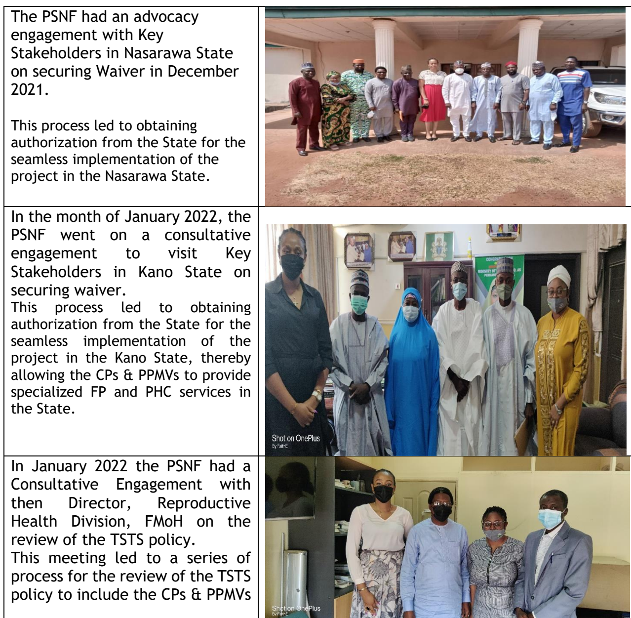
Table three: PSNF IntegratE Conducted Activities in 2021-2022

The table below gives a brief synopsis of key activities, successes recorded and milestones achieved during the 2021-2022 implementation of the PSNF IntegratE project.