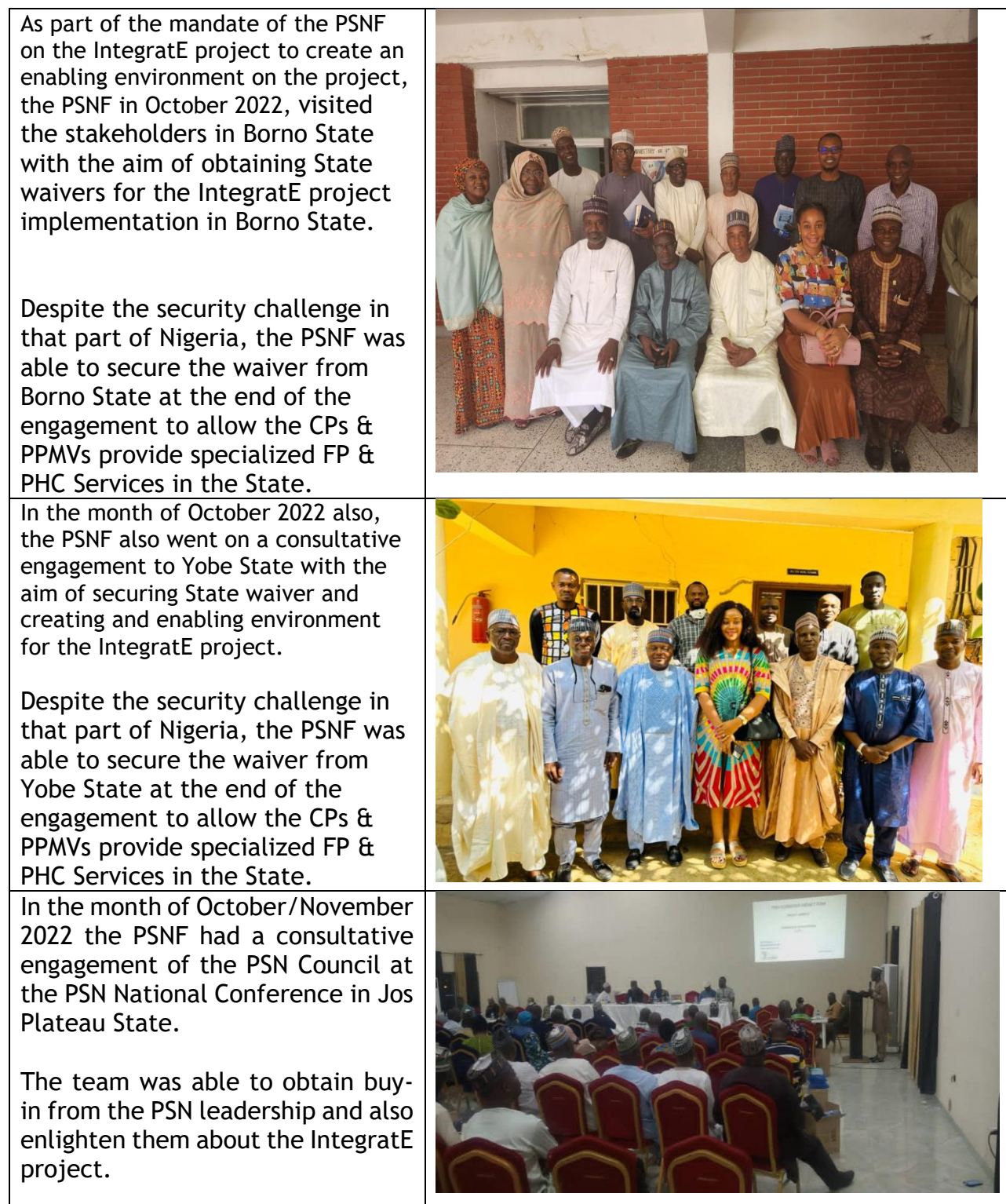
Table four: PSNF IntegratE Conducted Activities in 2022-2023

The table below gives a brief synopsis of key activities, successes recorded and milestones achieved during the 2023 implementation of the PSNF IntegratE project.